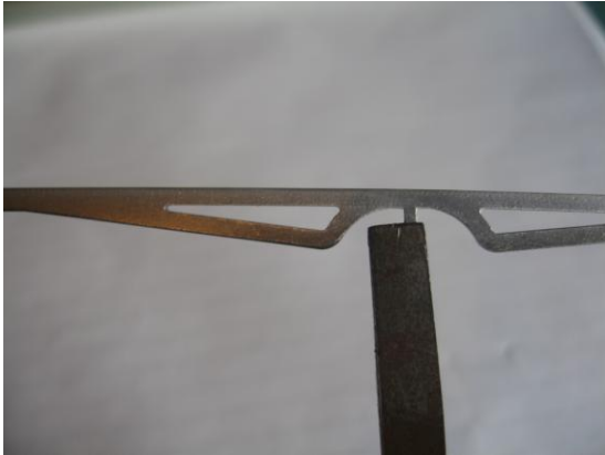
Step 1. Bend center piece 90 degrees