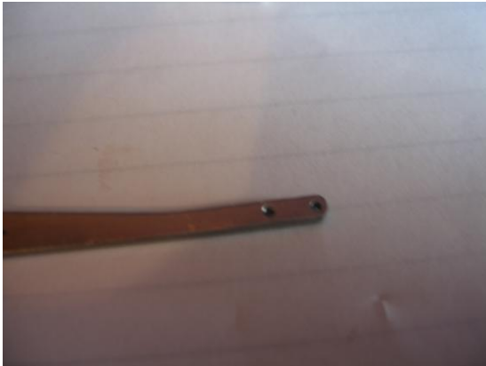
Step 4. File the ends smooth