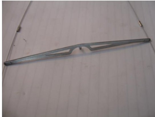
Step 5. Slide rigging wires thru holes