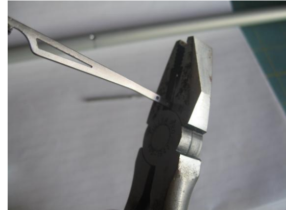
Step 3. Cut down to desired length with side cutters